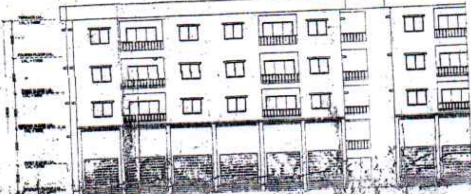
BACK SIDE ELEVATION SCALE = 1:100

Valid for Three Years From the Date of Sanctioned: 01-06-2018